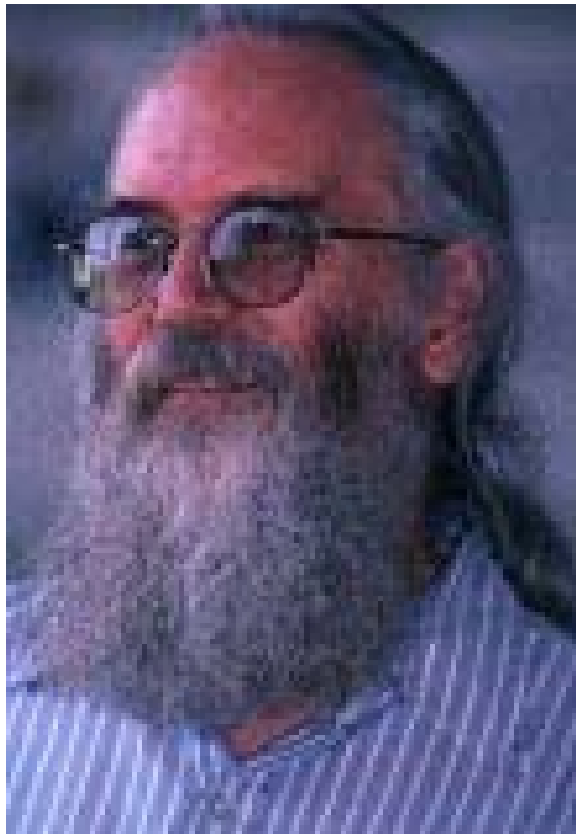
Jon Postel 1943-1998