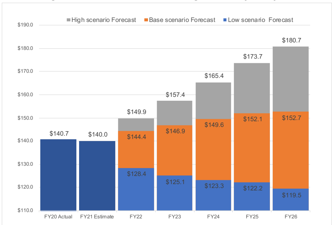
Figure 5: ICANN Forecast Funding Sensitivity Analysis

Considering all three scenarios over the FY2022-2026 forecast period, 5-year CAGR for ICANN's funding is projected to range from -1.8% (at the 'low' funding scenario) and 4.8% (at the 'high' funding scenario), with a 'base-case' 5-year CAGR of 1.4%.